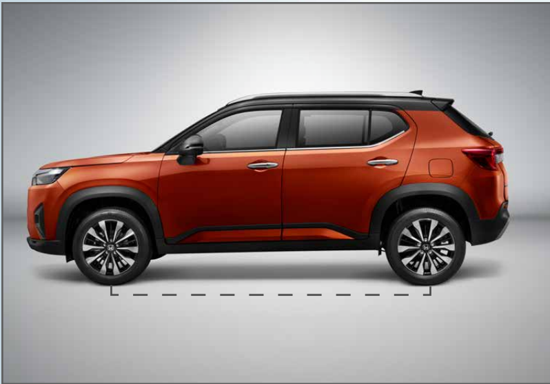
Long Wheelbase (2 650 mm)