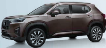
Golden Brown Metallic