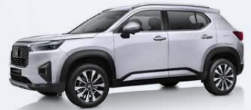
Platinum White Pearl