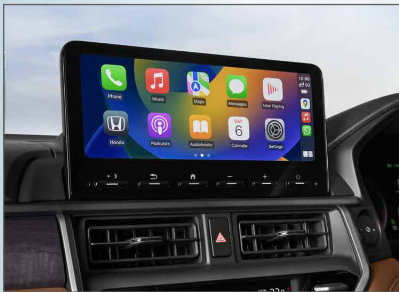
26.03 cm (10.25") HD Touchscreen Display Audio with Wireless Apple CarPlay & Android Auto