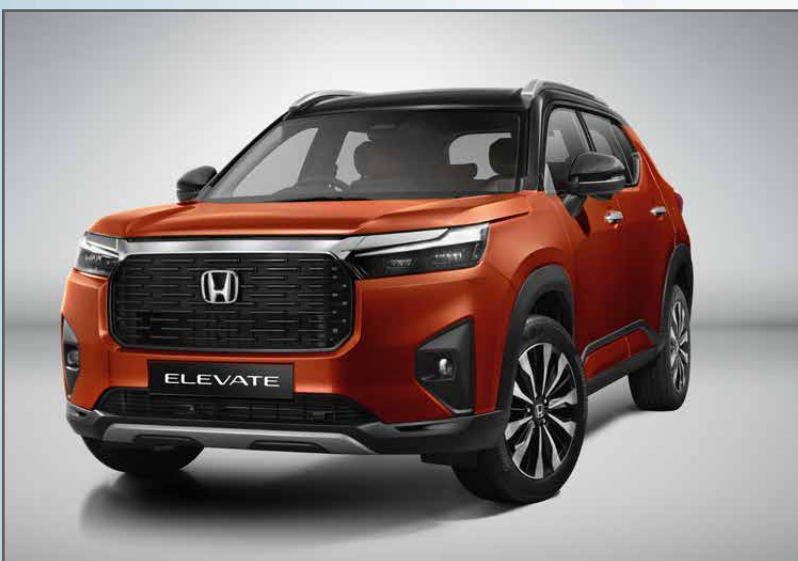
High Ground Clearance