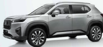
Lunar Silver Metallic