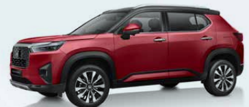
Radiant Red Metallic with Crystal Black Pearl Roof

Terms and conditions apply. The product & feature images shown in this brochure are for representation purpose only. Actual features, colour and specifications as shown may vary and may not be part of standard fitment. Appearance of black shade on glass of vehicle is due to lighting effect. Trim, colour, specifications and features are subject to change without prior notice. Please check the availability of the trim, colour, feature and specifications at authorized Honda Car dealerships *Amazon, Alexa and all related logos are trademarks of amazon.com, Inc. or its affiliates. Alexa device is not part of car accessory/giveaway and needs to be purchased separately. Actual device may differ from the one shown here. Please refer to amazon.com for more details. Honda Connect application works on select smartwatch devices and is subject to network availability and government regulations. Smartwatch is not part of car accessory/giveaway and needs to be purchased separately. Honda Sensing cannot substitute human acumen and vigilance while driving. Honda Cars India Limited urges drivers to follow traffic rules which are meant to keep them safe on roads. For more information, please visit our authorized dealership or www.hondacarindia.com .