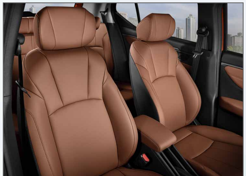
Plush & Comfortable Cabin