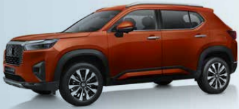
Phoenix Orange Pearl