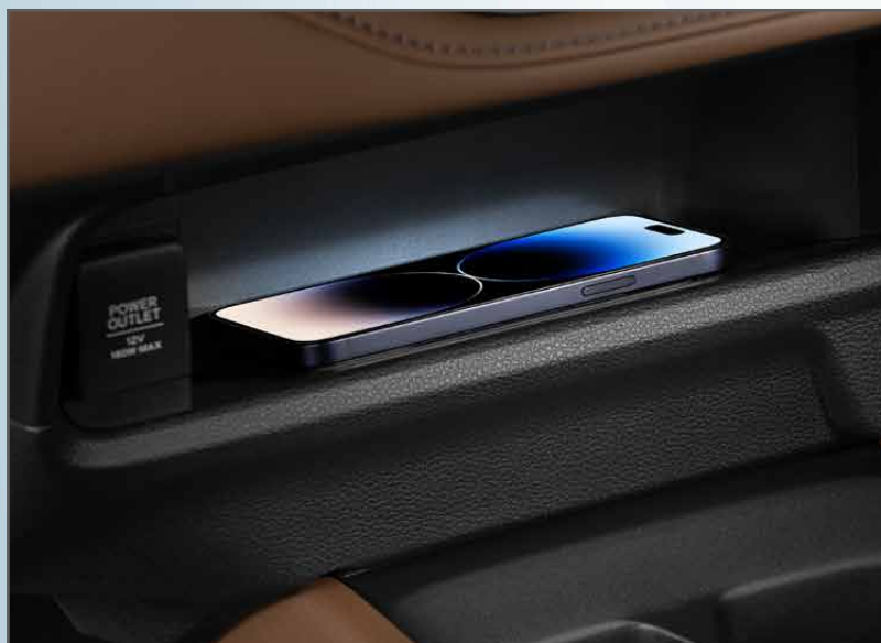
Wireless Smartphone Charger