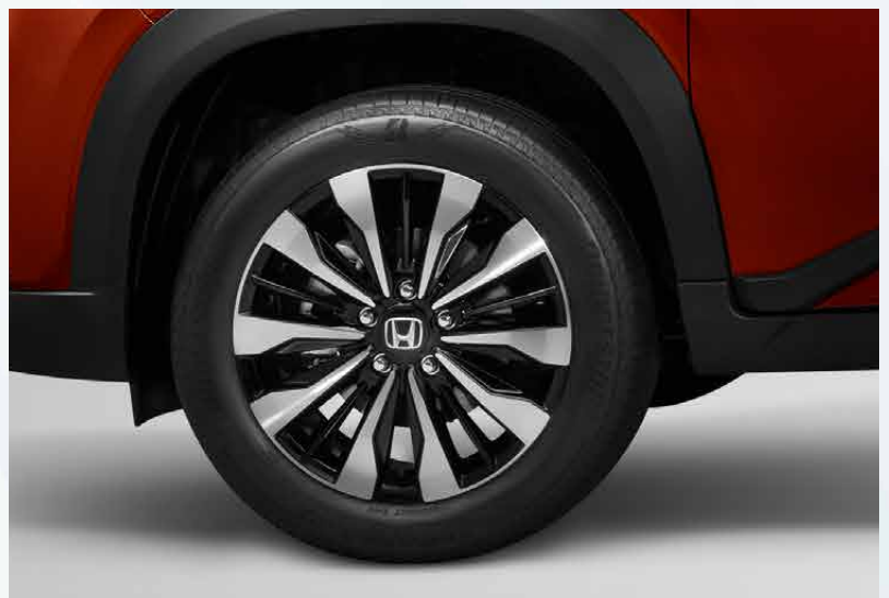
R17 Dual-Tone Diamond-Cut Alloy Wheels