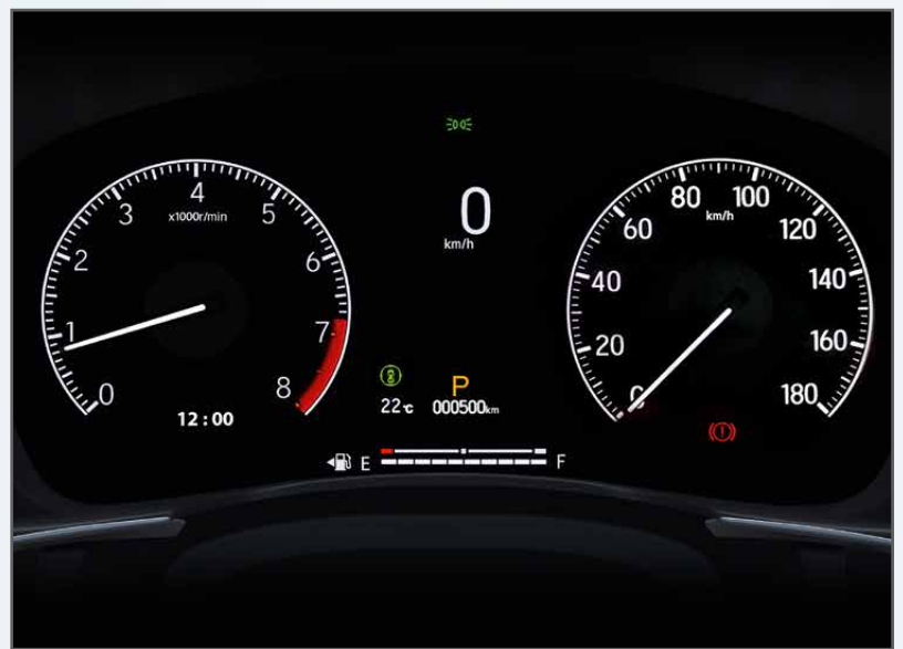
17.7 cm (7") HD Full Colour TFT Meter