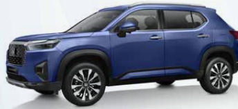
Obsidian Blue Pearl