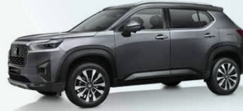
Meteoroid Gray Metallic