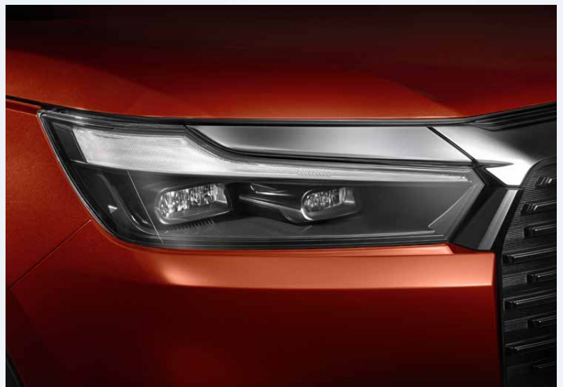
LED Projector Headlamps with LED DRL & Turn Indicators