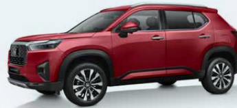
Radiant Red Metallic