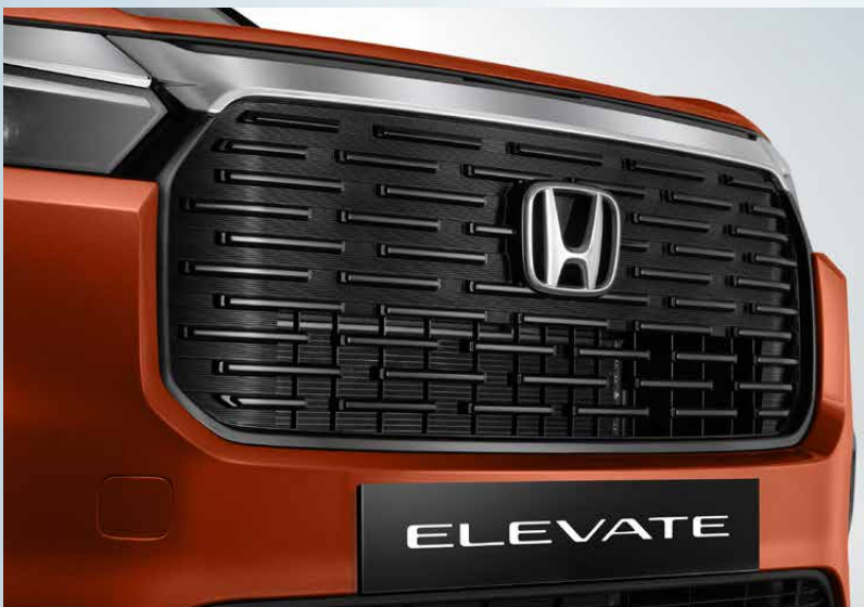
Bold Front Grille