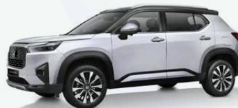
Platinum White Pearl with Crystal Black Pearl Roof