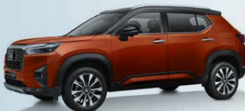
Phoenix Orange Pearl with Crystal Black Pearl Roof