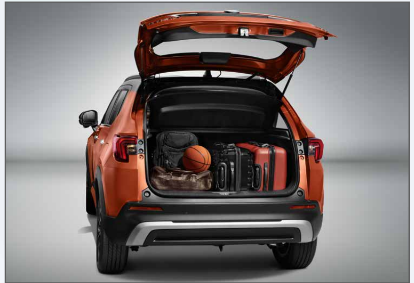
Large Boot Space (458 L) and 60:40 Split/ Foldable Rear Seats